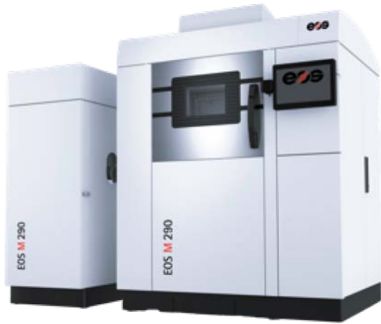
2 x EOS M290