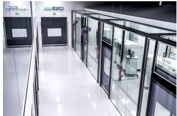
Figure 3 Workshop with the machines located in separated rooms with glass walls. Each room has a roll-up door.

reactive metals), one Aconity MIDI. Due to the variety of industries served by the